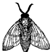
Figure 2: A sample black and white graphic (.eps format) that has been resized with the epsfig command.

Other common constructs that may occur in your article are the forms for logical constructs like theorems, axioms, corollaries and proofs. There are two forms, one produced by the command \newtheorem and the other by the command \newdef ; perhaps the clearest and easiest way to distinguish