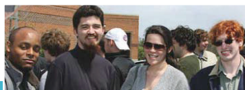
CSE students gather at the annual CSE picnic.