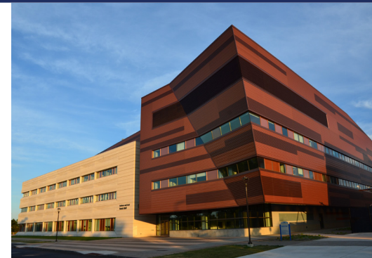
Davis Hall houses the departments of Computer Science and Engineering and Electrical Engineering.

Opportunities for computer engineers exist locally, nationally and internationally. Computer engineering graduates from the CSE department have joined some of the best companies in the field, including Apple, Amazon, Bloomberg, Cisco, Facebook, General Electric, Google, Hewlett-Packard, IBM, Intel, Kodak, Lockheed Martin, Microsoft, NASA, Nokia, Disney and Xerox.