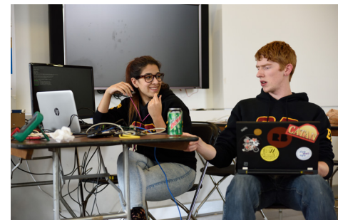
UB Hacking Competition.