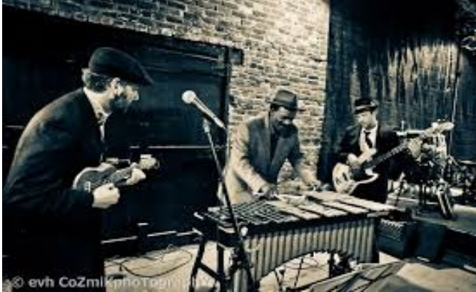
The Skiffle Lounge

http://www.reverbnation.com/skifflelounge