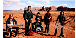
SPINDRIFT OFFICIAL RECORD RELEASE SHOW/SCREENING CLASSIC SOUNDTRACKS VOL.1