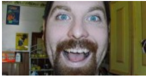
Vestiges of Vestige