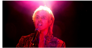
Jupiter in Velvet drops new CD