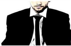
Black Death Bela Von