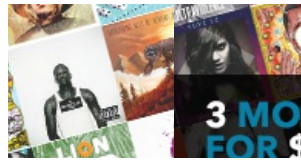
Is Artistpr.com a Scam or Legit? Read our review to find out