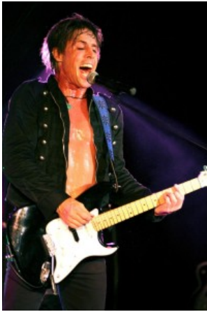
Artist: Jupiter in Velvet CD: Shut off your Mind