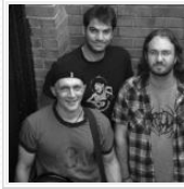
The Love Load - Three on a Match