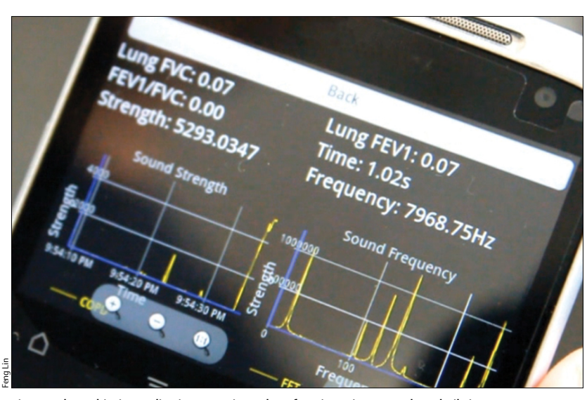
Figure 1: The Mobispiro applications to estimate lung function using smartphone built-in sensors

Technological innovations are revolutionising healthcare. According to Moore's law, computer processing speed and power will double roughly every 18 months, rendering more efficient and cost-effective technology systems every year. It is conceivable that innovations in the next 20 years will fundamentally change every process in health-care delivery. For example, sensors and microprocessors might become so affordable